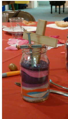
Photos of completed forgiveness activity