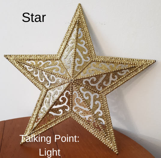
Talking Point: Light

Using items you likely already have around the house, you can create a fun, hands on experience for little ones