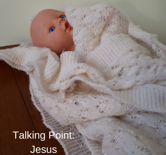
Talking Point: Jesus