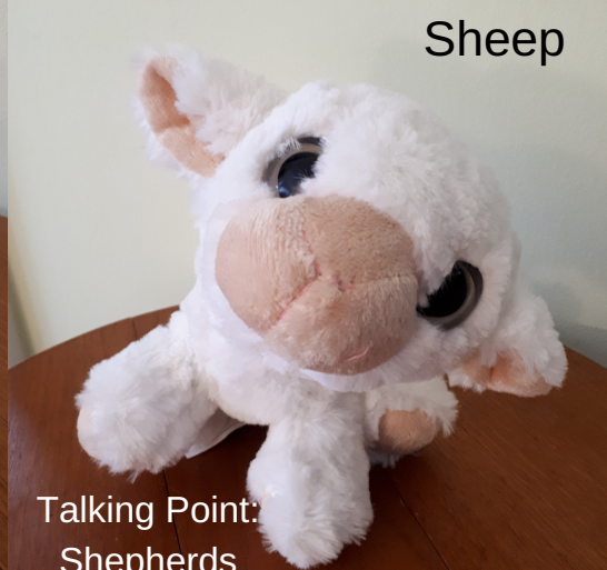
Talking Point: Shepherds