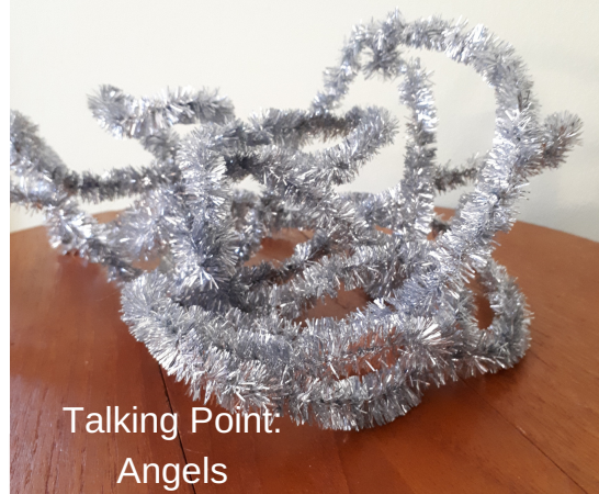
Talking Point: Angels