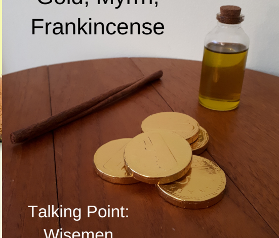
Talking Point: Wisemen