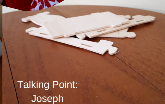
Talking Point: Joseph